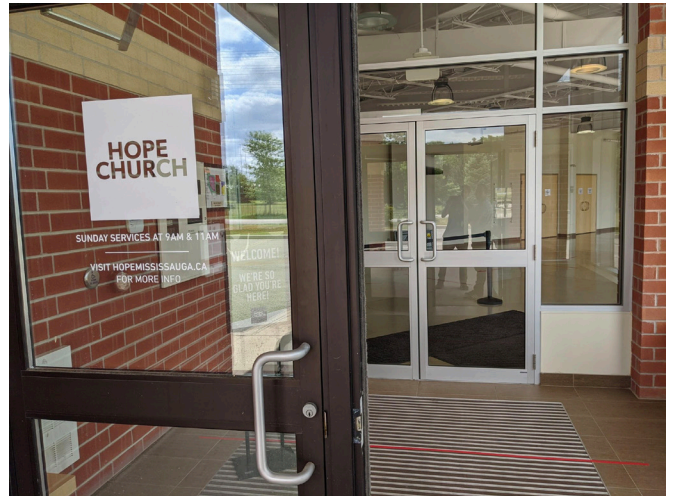
MAIN ENTRANCE DOOR