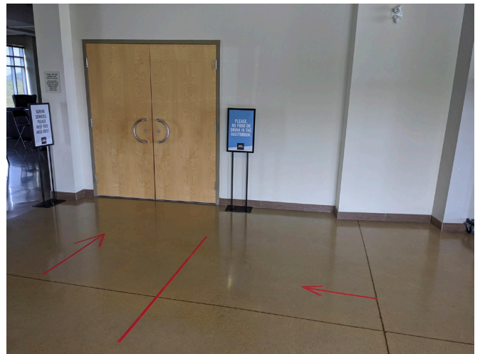
WORSHIP CENTER ENTRANCE